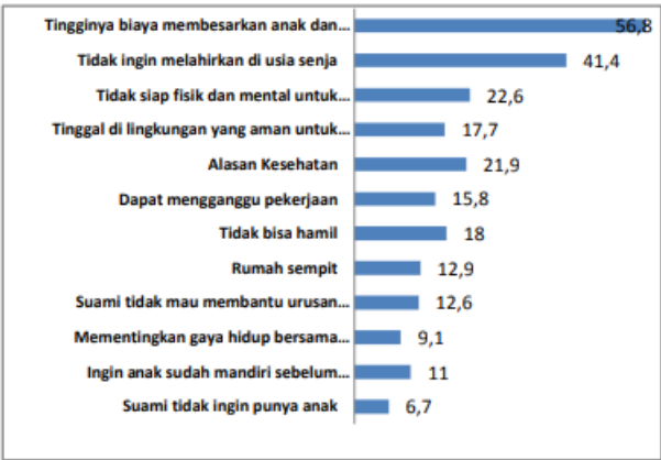
Figure 4. Considerations for not having the ideal number of children (2002)

The amount of household expenditure can be seen from the number of family members in it. The amount of expenditure also varies based on a person's age. For families with children, the age of the children also influences the amount of household expenditure. A newly born child has greater needs than a child who has entered school age. This is because at the age of 0 to 3 years, a child must receive support for good care and health. For more details, see Figure 4 below: