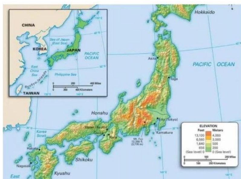
Figure 1. Japan Country Map

Japan is one of the East Asian countries that has advantages in various fields such as culture, technology and economics. 1 Japan is a country in East Asia. It has a population of more than 125,000,000 people in 2020 and an area of 377,962, which is an archipelagic country. Japan's territory is divided into small islands that form a unified seafaring nation. In the field of technology, there is no doubt that Japan already has a lot of industrial represented throughout the world, one of which is Toyota in the automotive industry. From an economic perspective, Japan is a country that can develop very quickly. It can be seen that Japan experienced an economic recession at the end of World War II as a country that lost the war. 2 However, currently Japan is one of the countries with economic power in Asia and even in the world. In terms of culture, even though the country has become a developed country that continues to embrace globalization, Japanese people really adhere to their culture. 3